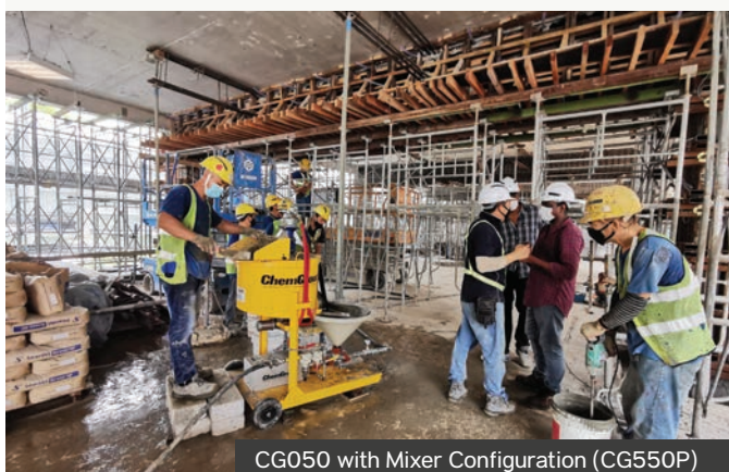
CG050 with Mixer Configuration (CG550P)

The CG030 is built for power and versatility, enabling a wider range of applications. From cement slurries to sanded mixes, its large 3" piston pump is very capable while still maintaining a relatively small footprint.