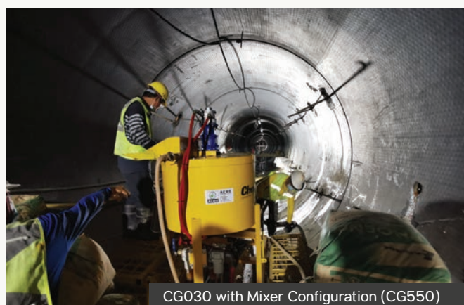
CG030 with Mixer Configuration (CG550)