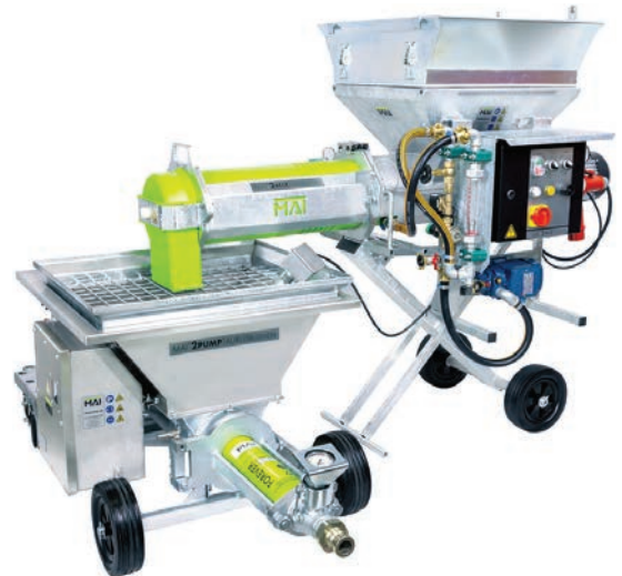
MAI Maia Mobil with MAI 2Pump Taurus sold separately