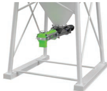
MAI 2Mix MAIA - Silo Configuration