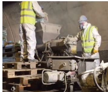
MAI 2Mix MAIA & MAI 2Pump Taurus Configuration