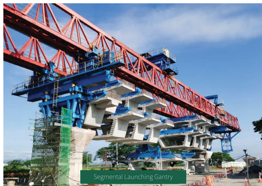
Segmental Launching Gantry