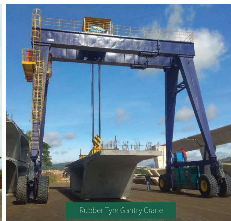
Rubber Tyre Gantry Crane