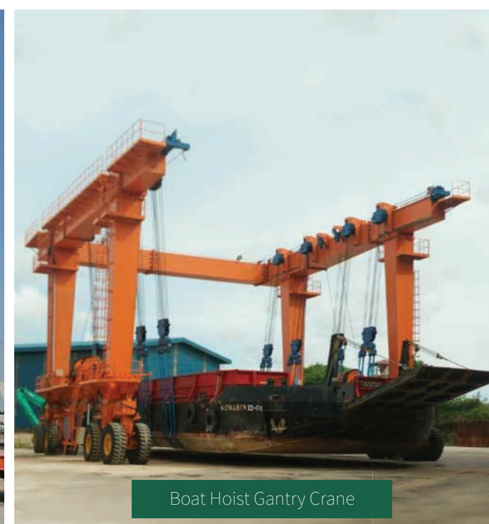
Boat Hoist Gantry Crane