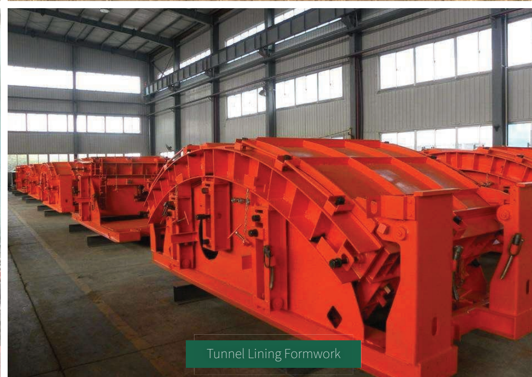
Tunnel Lining Formwork