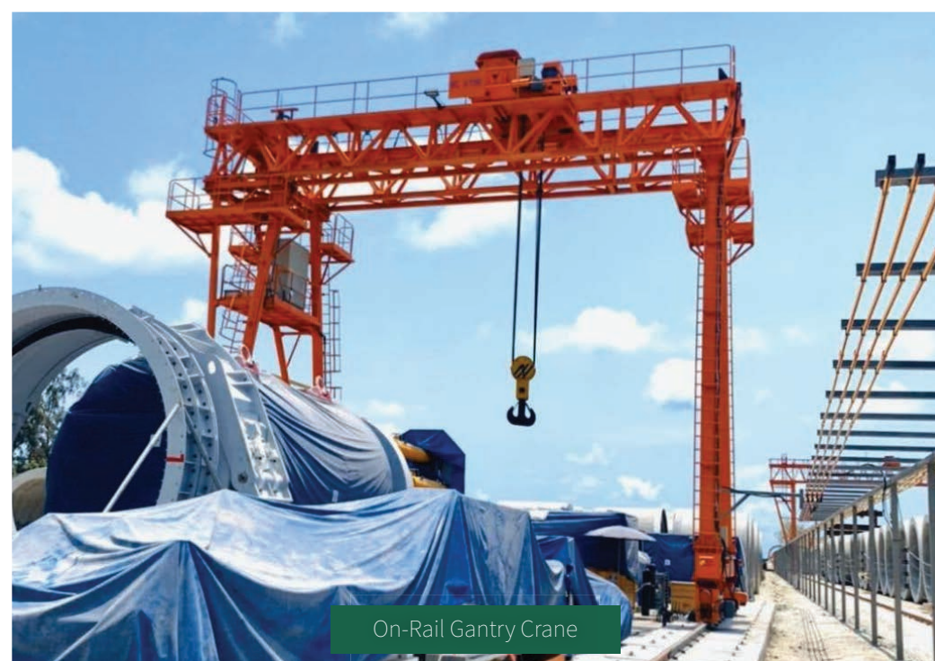
On-Rail Gantry Crane