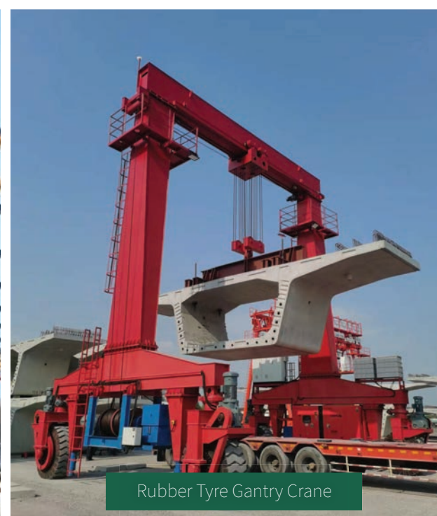
Rubber Tyre Gantry Crane