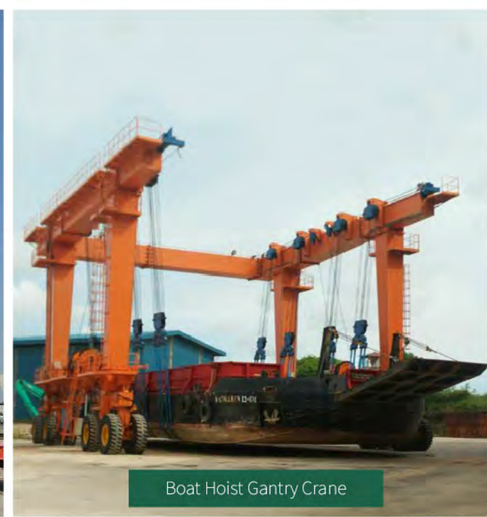
Boat Hoist Gantry Crane