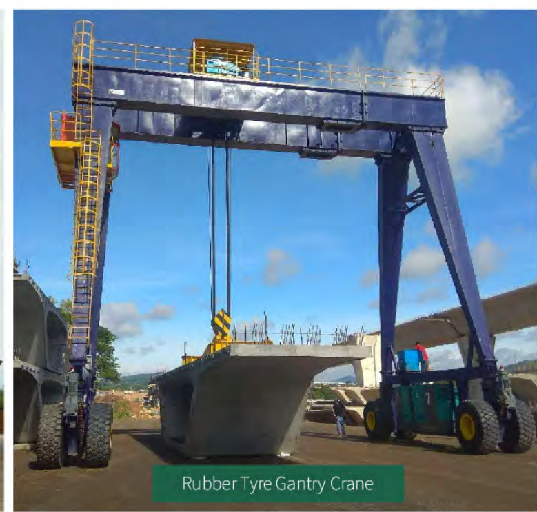
Rubber Tyre Gantry Crane