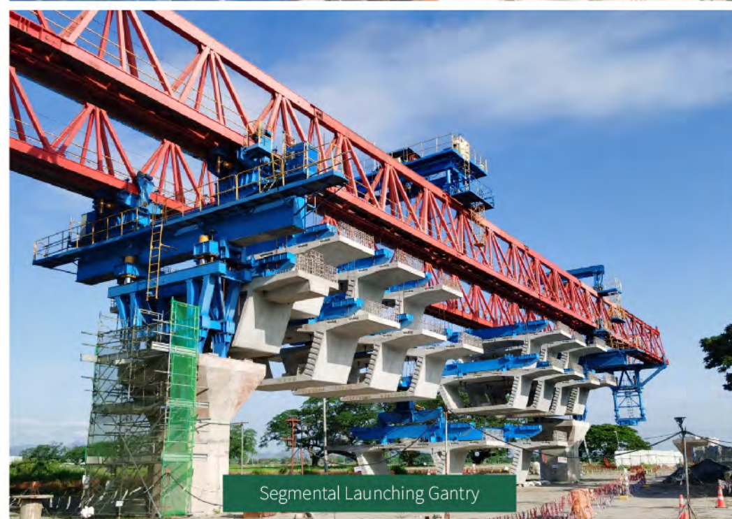
Segmental Launching Gantry