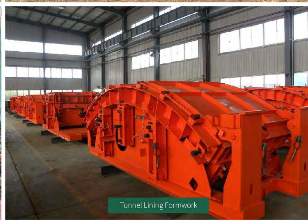
Tunnel Lining Formwork