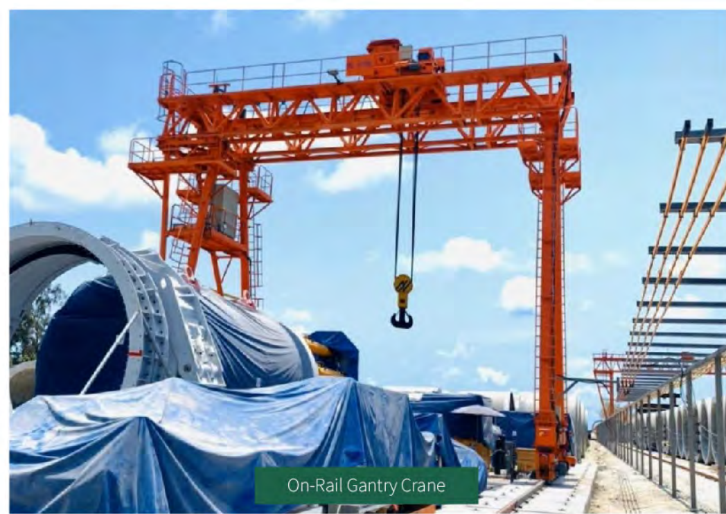
On-Rail Gantry Crane