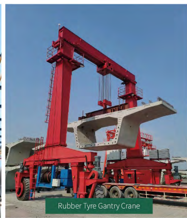
Rubber Tyre Gantry Crane