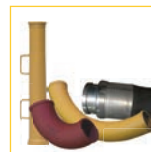
Steel Pipe, Reducer & Hoses