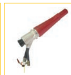
Spray Guns & Nozzles