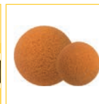
Cleaning Sponge Ball