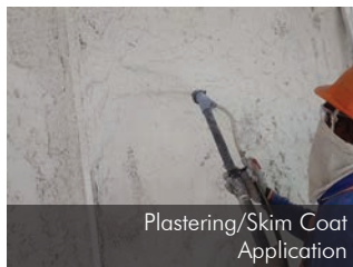
Plastering/Skim Coat Application