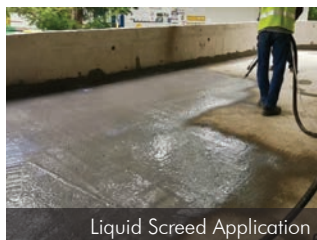
Liquid Screed Application