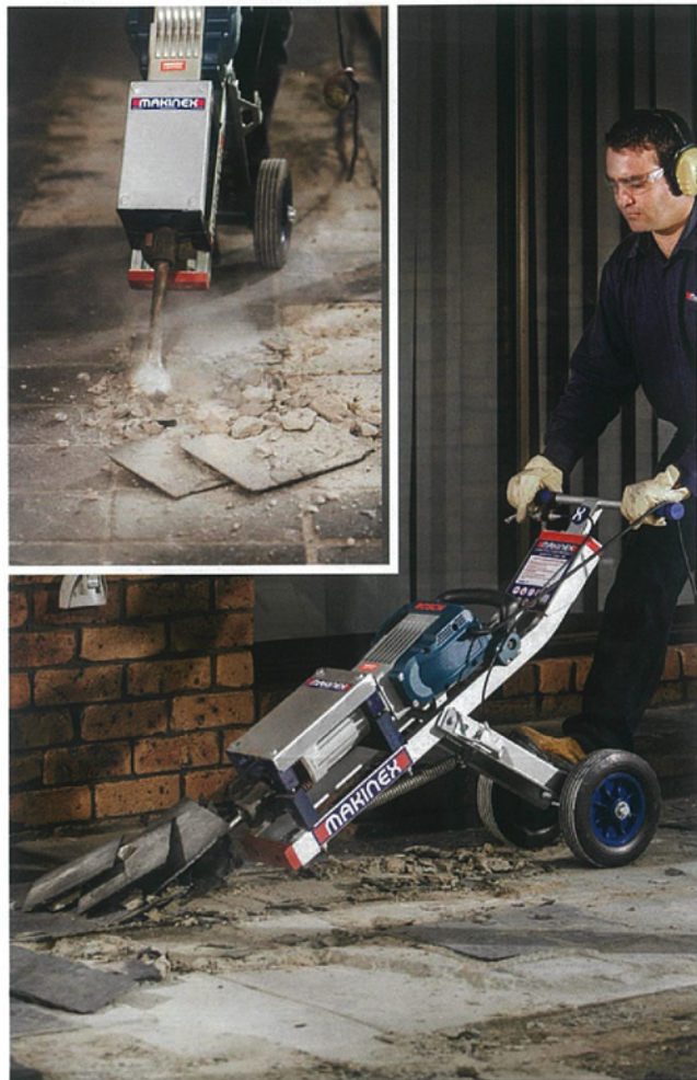
Adjustable positions ranging from 20 - 80 degrees to suit most demolition jobs.

THE MAKINEX JACKHAMMER TROLLEY is a versatile demolition tool that removes floor tiles, parquet, and mortar beds. It can also prepare surfaces by removing residue from tile beds and concrete floors.