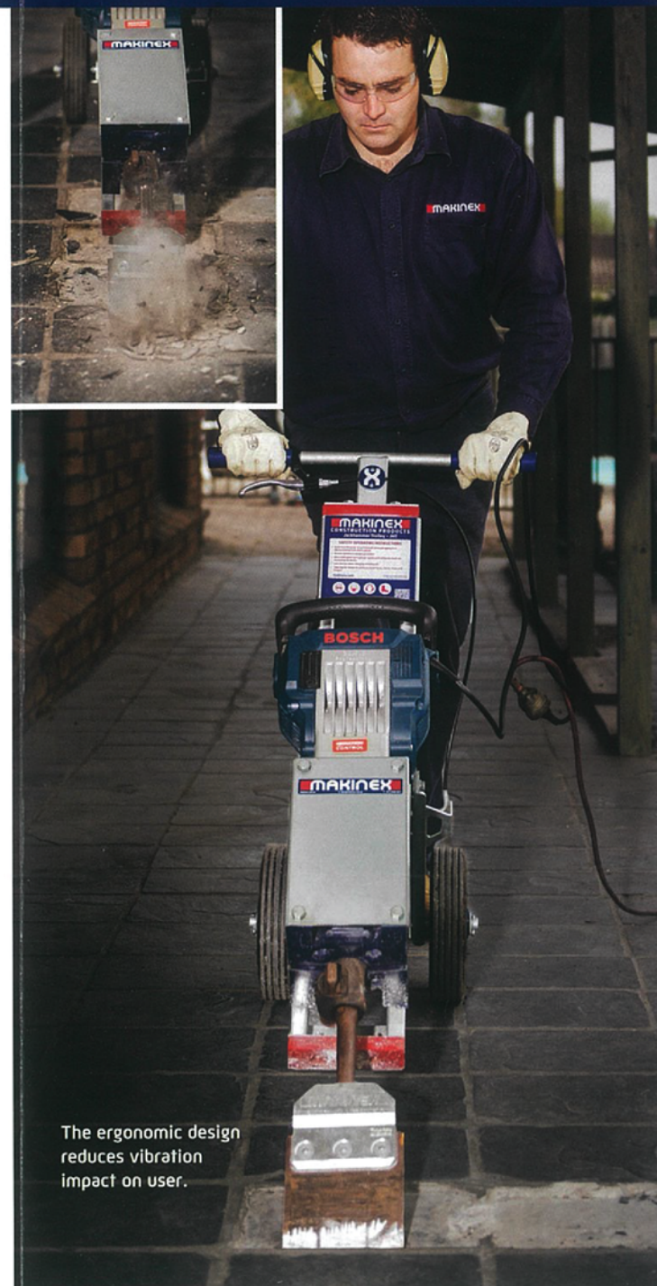
The ergonomic design reduces vibration impact on user.